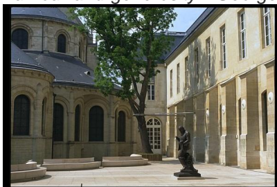
Musée des Arts et métiers.

Museum : Musée des arts et métiers. L'entrée du