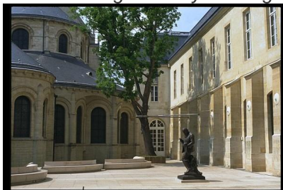
Musée des Arts et métiers

klezmer music, the music of the Jewish communities Eastern Europe. They perpetuate the tradition of "wanderers impregnated with the rhythms of the world, with all its fashions, all the melodies met on the way. Yankele means ir Yiddish Little Jack, though their art is anything but little. >From very different backgrounds, from classical, jazz, 'chanson', and bossa nova, they unite their talents and their instruments - and even their voices - to enkindle their creativity. In this new opus, they take us on a return trip from Paris to the origins of klezmer, in a union of flavours (French waltz, gypsy airs, Israeli lullabies, and so many others). Yankele express their personality with tenderness, with humour and generosity". Georges Moustaki. See photo gallery. Museum : Musée des arts et métiers. L'entrée du